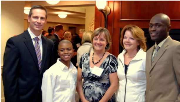
October 2010, Big Brothers Big Sisters of Toronto at Queen's Park Reception

As the year draws to a close, we have much to be thankful for. At our Big Night Out Gala in June, many of our guests participated in our Match Auction and as a result we have matched 69 Littles with mentors and have an additional 11 in the process. Contemplating the season before us, I encourage you to remember those children who continue to wait for a mentor.