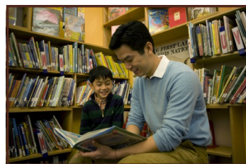
Teach your Little